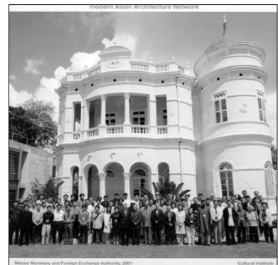
Photo 1 mAAN Inaugural Conference 2001, Macau

In the operation of mAAN, having virtually no funds, mAAN must rely on volunteer spirit of the members and thrifty operation, especially in many of the workshops it organizes. The Network gives much autonomous power to the "grassroots" groups. The result was recent formation of national sections in Indonesia, Turkey and Japan. Dynamic and informal structure encourages self-initiated activities in various localities throughout Asia. Any group in the mAAN network can freely initiate activities in their region. They can announce the events on various mailing lists or any media to disseminate information to the public.