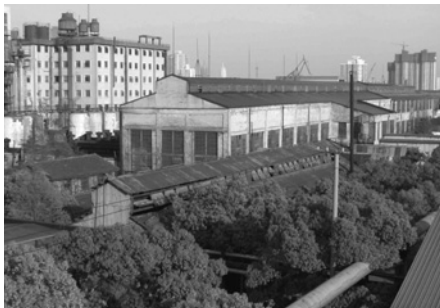
Photo 2 Shanghai Factory

The two-week session produced eight proposals which were diverse in their concept and direction. A group, taking their ideas from Lilong, the Shanghai multi-family housing prototype from late 19 th Century, inserted live-work environment in the factory complex. Another unit took the idea of the “banal”, to celebrate the ordinary daily spaces of the factory buildings. Landscape architecture approach was also presented. Analyzing the exterior spaces, one group manipulated landscape vocabulary to organize animated public spaces on the site. Historical approach was lead by a Japanese architect/professor whose specialization is in historical engineering. His team took “takuhon”, or rubbing imprint of historical manhole covers and street pavement patterns to expuress the elapse of time and wear and tear of the buildings and landscape. A group lead by an Osaka architect, took the main axis of the site and rotated it to create odd space configurations, based on the “urban noise” theory he has put forth.