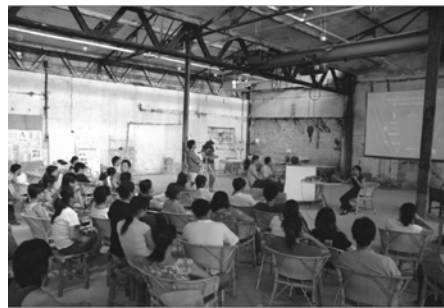
Photo 3 Session at the Shanghai workshop