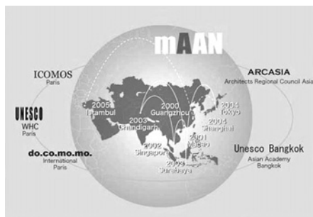
Figure 1. mAAN network and conferences

The organizational chart indicates the multi-sphere structure. Within the outer sphere are various regions of Asia with network connections indicated in lines which are free-form in nature. On this network are various projects, workshops, conferences and events initiated by mAAN which are represented by the small squares. Symbolic meaning of these lines and the squares is that these projects and events can be generated at any space-time within Asia if it is consistent with the goals and objectives of mAAN. At the edge of the outer sphere are several organizations affiliated with mAAN. The affiliation is defined by the organizations whose principals are members of the “Core” and whose philosophy is compatible with that of mAAN. Further out on the field on the chart are other organizations which have working relationships with mAAN.