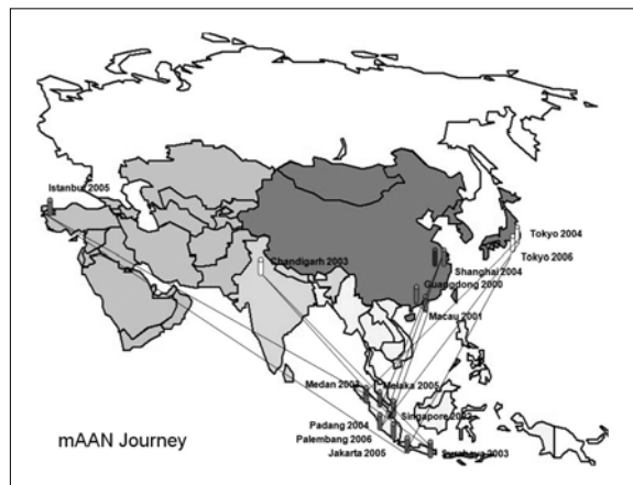
Figure 3. mAAN conferences

At most of the annual conferences, mAAN Declaration is issued to the public. For example, at the First mAAN International Conference, held in 2001, a "Macau Declaration" proclaimed the founding of the network and set the direction for mAAN. It stated that "...Modern Asia did not develop in isolated condition, but has evolved through sustained interactions with the West, which has had a constant presence in the collective consciousness of Asia." The Declaration recognized the colonial influence as a valued memory of how Asians dealt with the West, with the neighbors and with themselves. mAAN put forth architecture, as a medium, which recorded the history of Asia becoming "modern." Footprints of such journey are manifested in various forms of architecture existing throughout Asia.